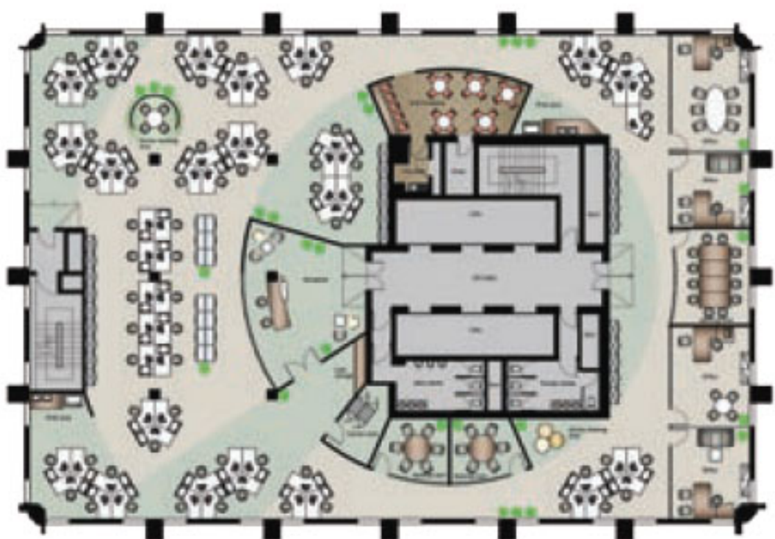
MEDIUM DENSITY INDICATIVE PLAN